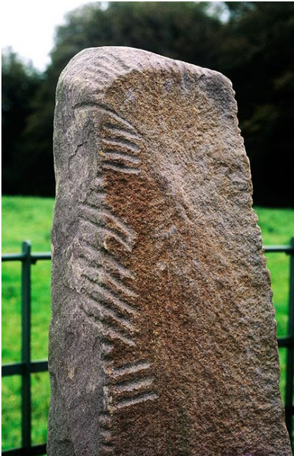
A stone with an Ogham inscription from Co. Kerry, Ireland

The Ancient Celtic peoples which include the Irish and the Scottish Celts (the Scots came from Ireland) seem to have venerated trees. Months of the year seem to have had tree names and some letters of their alphabet are called after trees (Irish and Scots Gaelic are closely related languages).