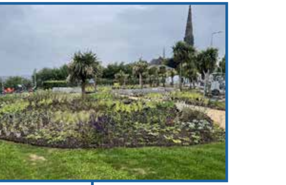
Image shows the final sections of turf being laid

Seating elements New seating is designed to be accessible and inclusive.